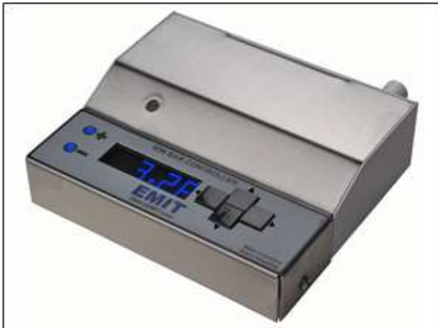
Figure 1. EMIT Pulsed Ion Bar Controller